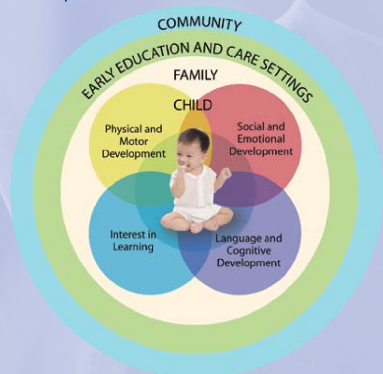
Figure 1 The Components of School Readiness

In this report, we look at the different facets of school readiness and recommend actions that promote children's healthy development and school success. Our focus is on children from birth through age five. We hope the report will inform discussions and decisions that improve the environments in which Hawai'i's young children live and learn.