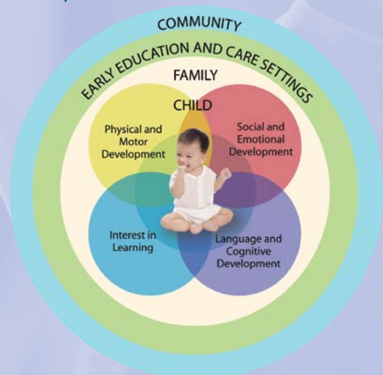
Figure 1 The Components of School Readiness

In this report, we look at the different facets of school readiness and recommend actions that promote children's healthy development and school success. Our focus is on children from birth through age five. We hope the report will inform discussions and decisions that improve the environments in which Hawai'i's young children live and learn.